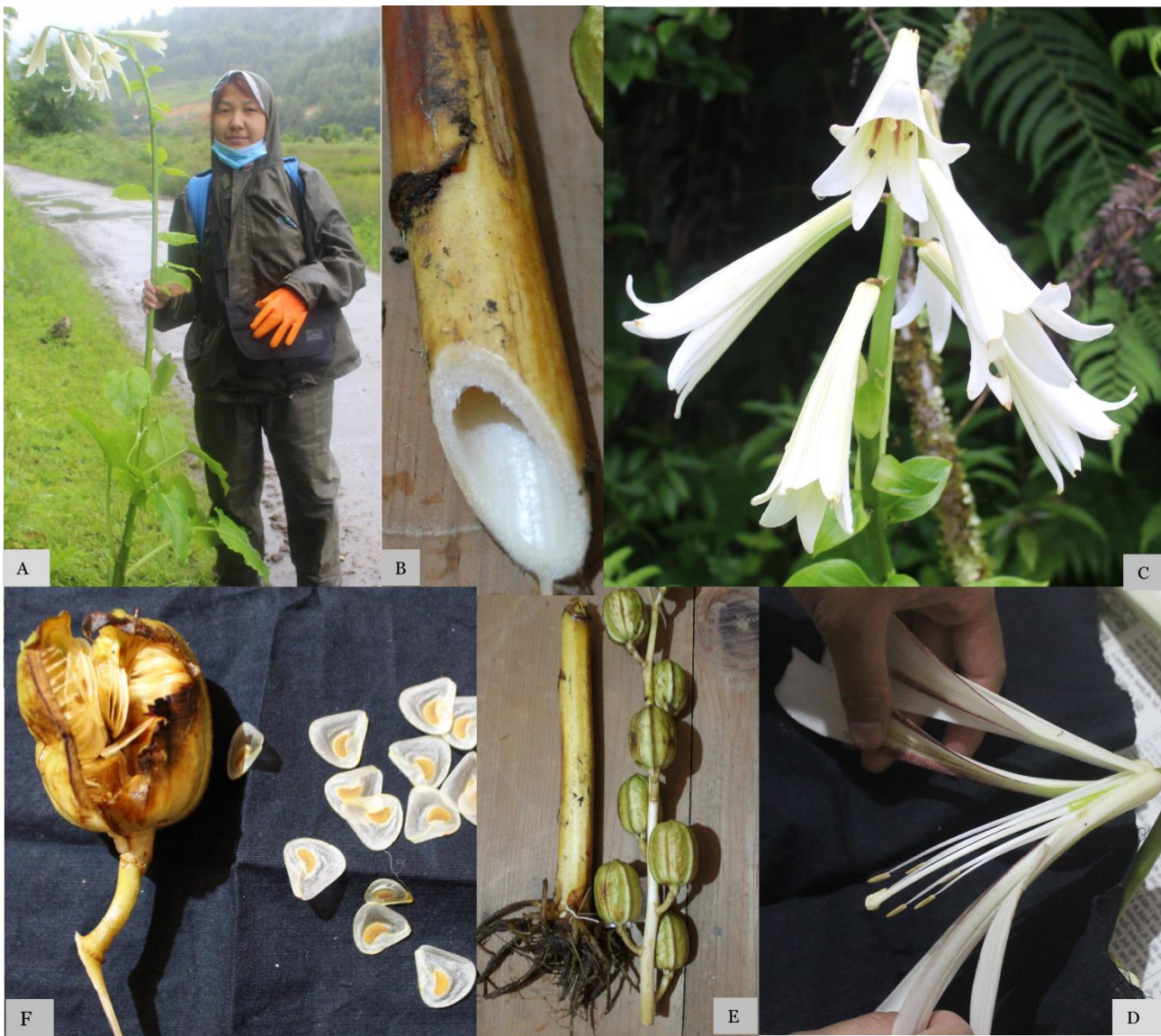
Figure 1A. Cardiocrinum giganteum (Wall.) Makino (Liliaceae), known as Giant Himalayan Lily collected from Shi Yomi, Arunachal Pradesh; 1B. Hollow stem of C. giganteum used for making flutes; 1C: Flower of C. giganteum (Wall.) Makino; 1D. Photo showing the long filaments (anthers attaining equal height as that of stigma facilitating self-pollination) of C. giganteum flower; 1E. Matured fruits; 1F: Seeds with translucent wings dehisced from matured fruits.